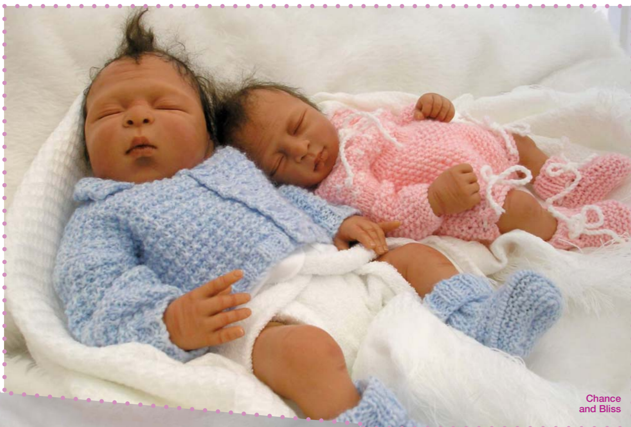
Chance and Bliss